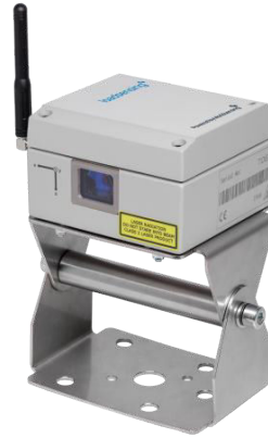
Fig. 4: LaserTilt90 mounted on a swivel mounting bracket WS-ACC LAS-NSB on a horizontal surface.