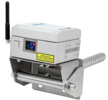
Fig. 5: LaserTilt90 on a swivel mounting bracket LS-ACC-LAS-SB attached to a WS-ACC-LAS-NSB ADAP to be installed with a convergence bolt G3/8" male thread.