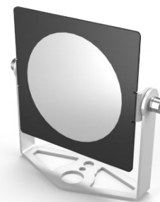
Fig. 6: Laser target WS-ACC-LAS-TG. Recommended to increase laser readings accuracy when beam points the surface in an oblique angle.