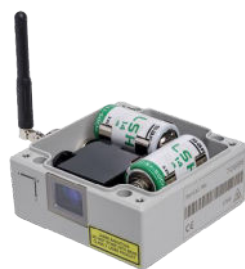
Fig. 2: Inside view of the LaserTilt90.