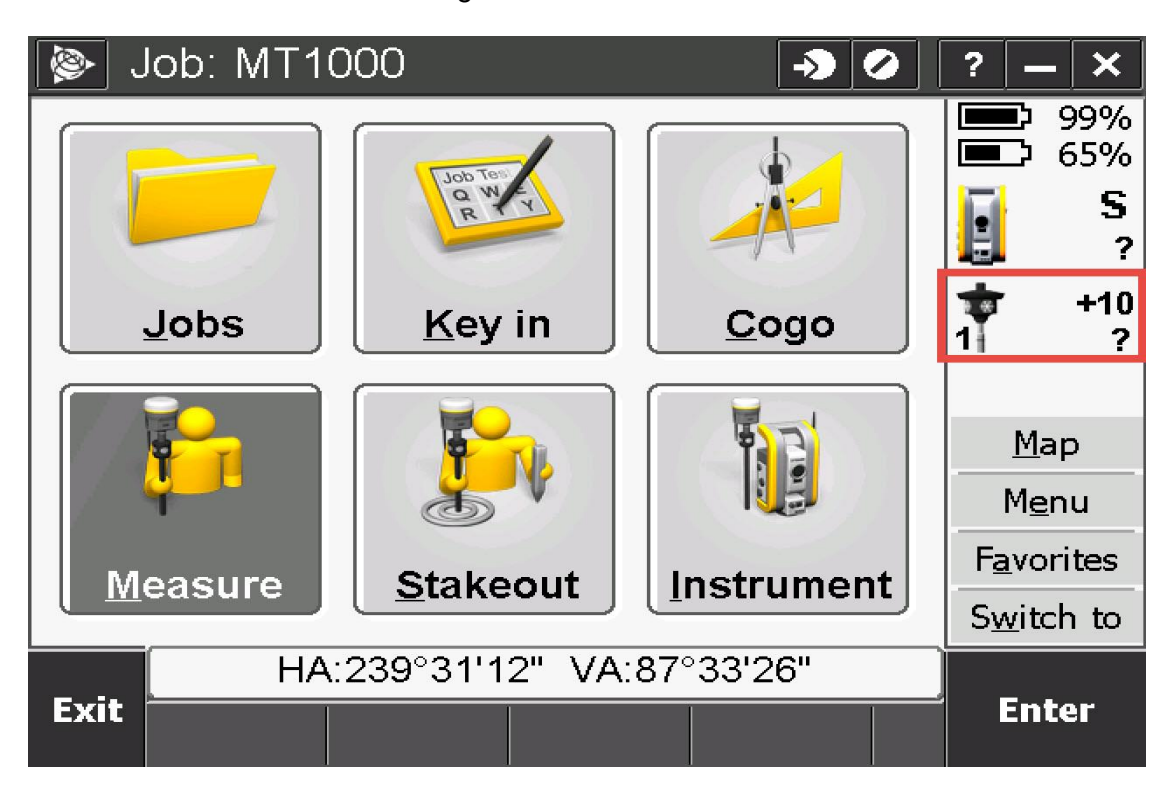
Step 1. In Trimble Access click on the target icon.